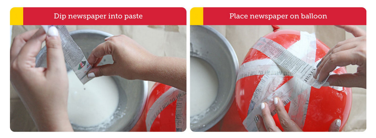
Step 3 – Dip newspaper strip into paste, squeezing off excess paste. Apply to balloon.

Step 4 – Repeat Step 3, layering newspaper on until the balloon is covered three to four layers deep. Leave an opening at the top for candy.