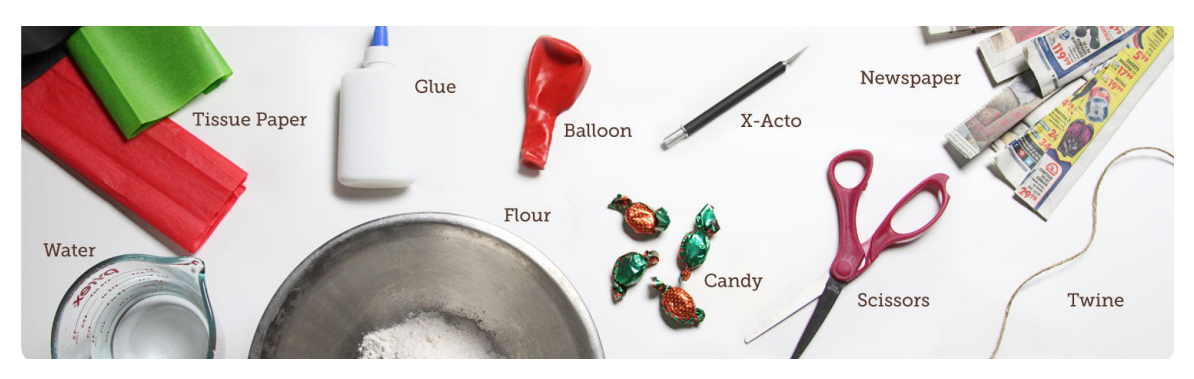
Step 1 – Mix one part water with one part flour to create paste.